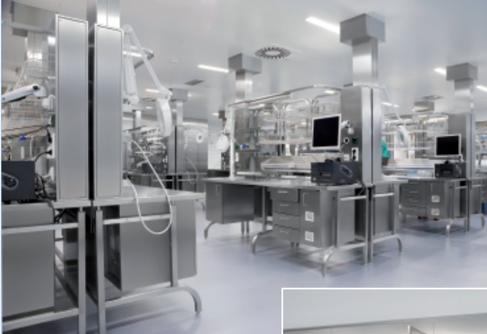
Central sterilisation unit Packing tables for packing sterile material